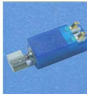
Silicon Rubber Case+ Contactor