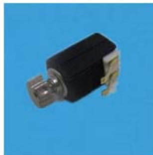
Silicon Rubber Case+ Metal Dome