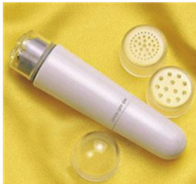
Hairdressing health care products/美容保健品