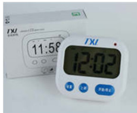
Electronic products 電子產品