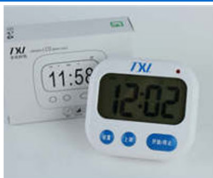
Electronic products 電子產品