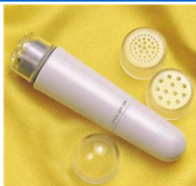
Hairdressing health care products/美容保健品