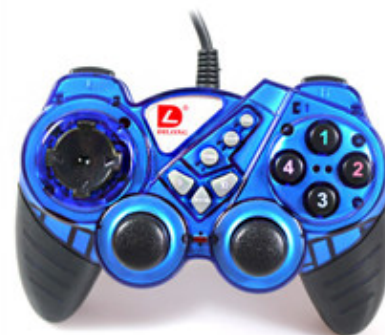
Electric toys 電動玩具