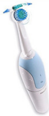
electric toothbrush 電動牙刷