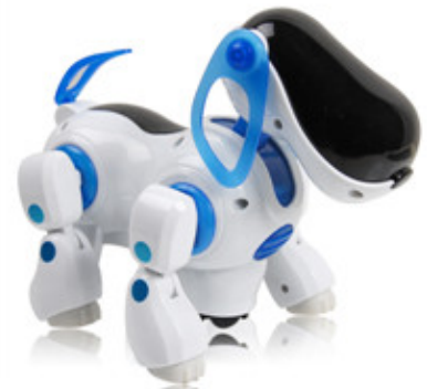
electric toys 電動玩具