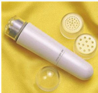
hairdressing health care products/美容保健品