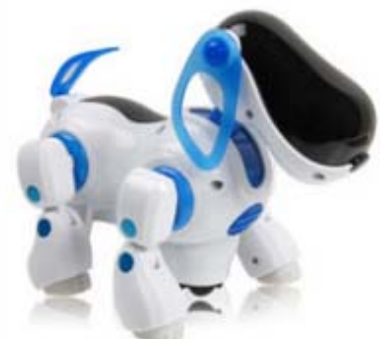
electric toys 電動玩具