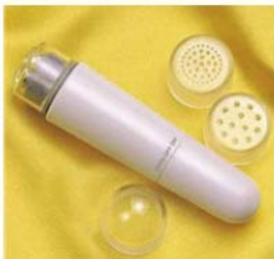
hairdressing health care products/美容保健品