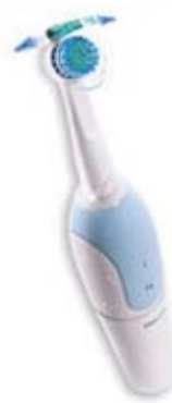
electric toothbrush 電動牙刷